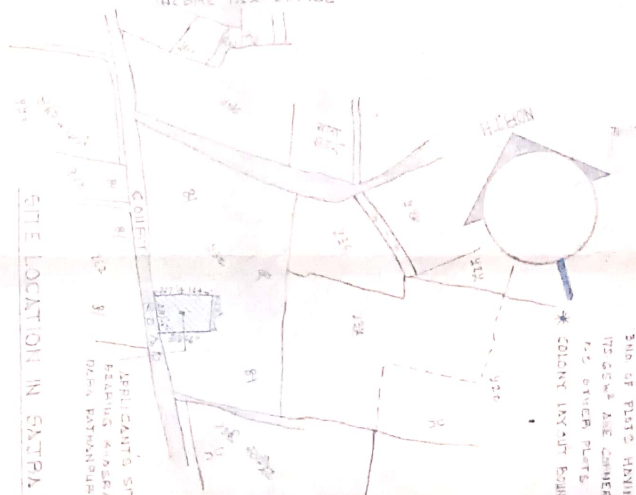
SITE LOCATION IN SATRA PLAN